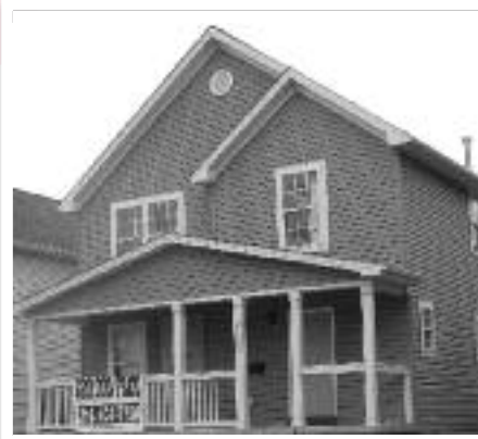
2189 E. 70th Street b/w Cedar & Central Avenues

The American dream of homeownership is obtainable and affordable in the Kinsman and Central neighborhoods. BBC offers free pre purchase housing counseling to first time home buyers. A certified counselor is available to walk you through the homeownership process. Counseling includes budgeting, credit repair, financial assistance, tax abatement, fair housing practices, and available homes for sale.