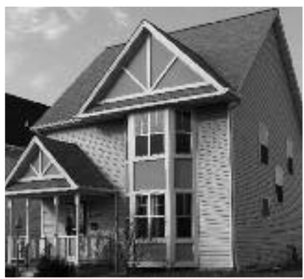
2268 E. 73rd Street b/w Cedar & Central Avenues